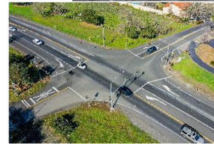
SR-29 & Oakville Cross Road