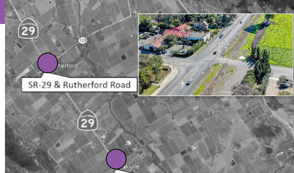
SR-29 & Rutherford Road