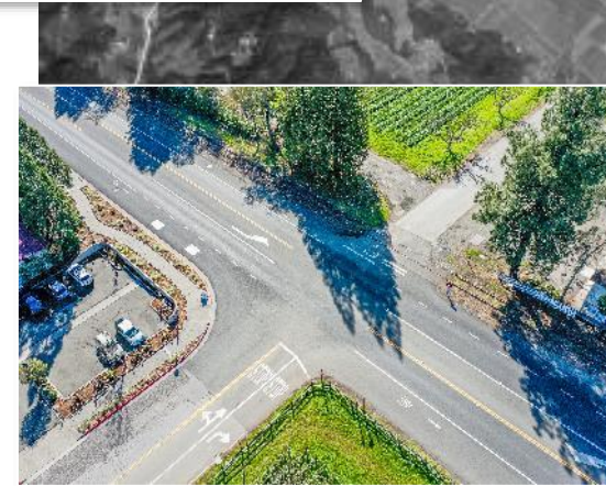
SR-29 & Madison Street