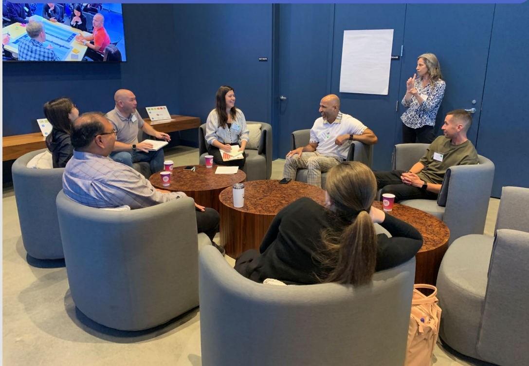
Complete: Santa Clara County